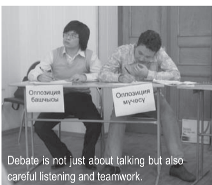
Debate is not just about talking but also careful listening and teamwork.

media surveyors, and of course, the participants of the tournament that came from various universities across Bishkek. There were 17 teams overall that came from AUCA, "Manas", Bishkek State, National