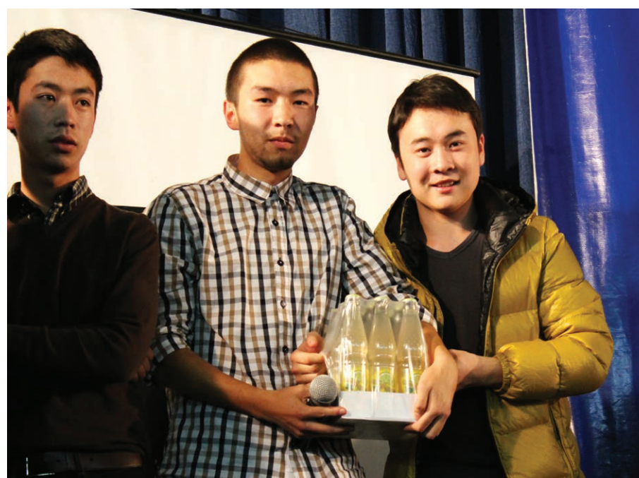
Law Department team awarded for the best joke of the evening