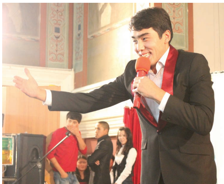
The host greets a near-empty auditorium