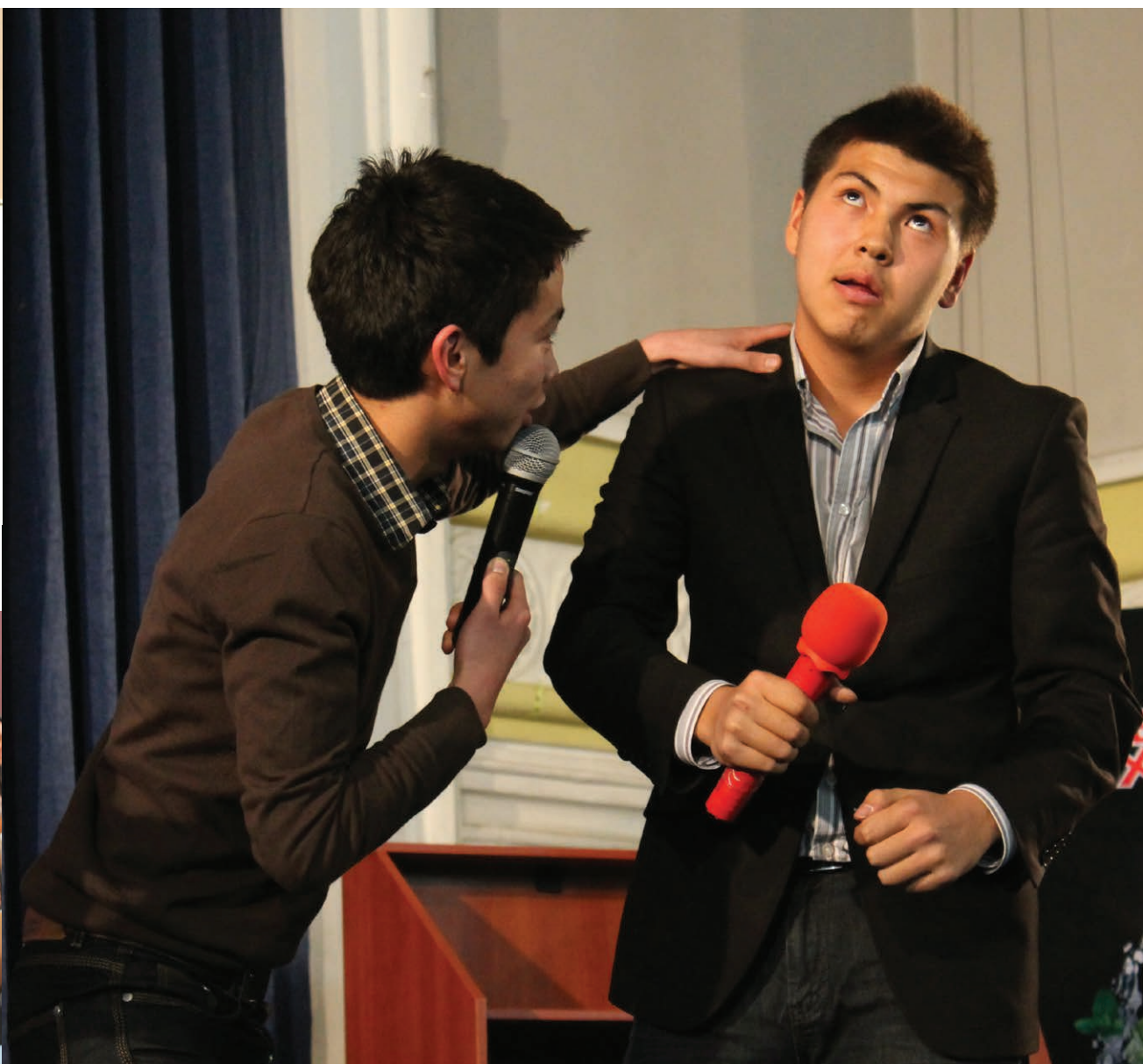
The best team of the evening