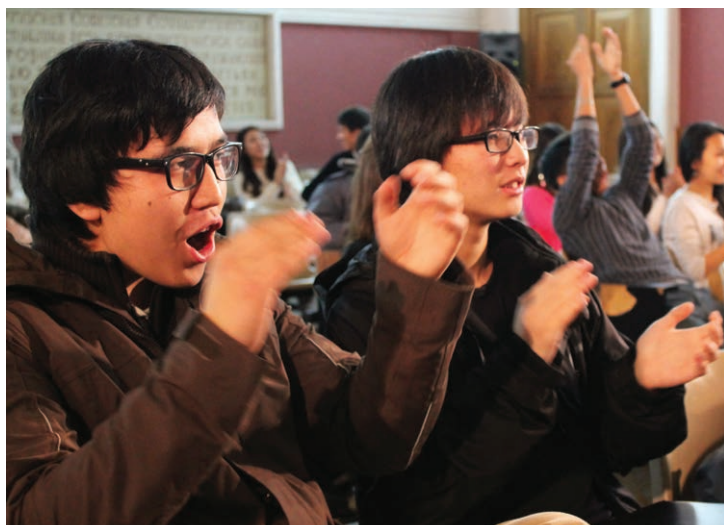
Jokes were mostly aimed at AUCA audience