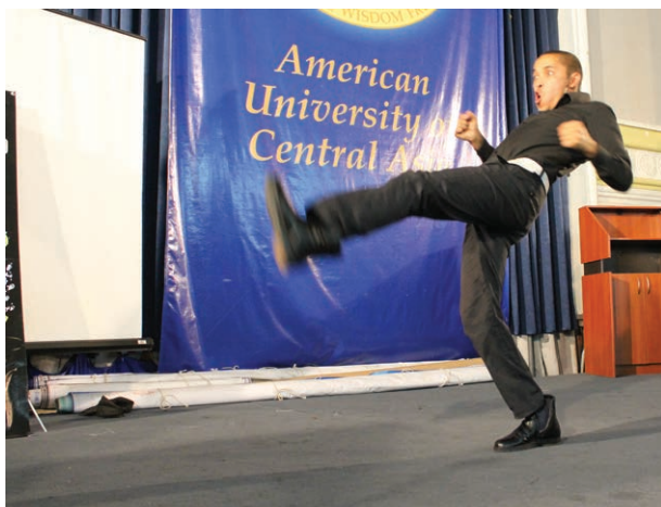
Photoreport KVN is no longer a funny business? p.5