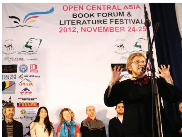
AUCA hosts first central Asian book forum p.3