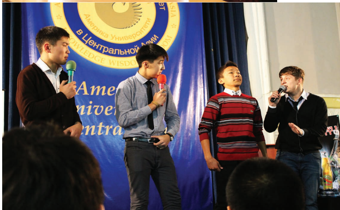
The guests from Kyrgyz National University

"The best joke of the evening" prize was given to "Myzhyuristy" ("We are lawyers") team for their motto of AUCA: "АУЦА, АУЦА, ограбь маму и отца" ("AUCA, AUCA, rob your mother and your dad"). It is notable that the best joke occurred in the warming-up contest. It reminds about the fact that KVN is not only about rehearsed numbers, but about the improvisation as well.