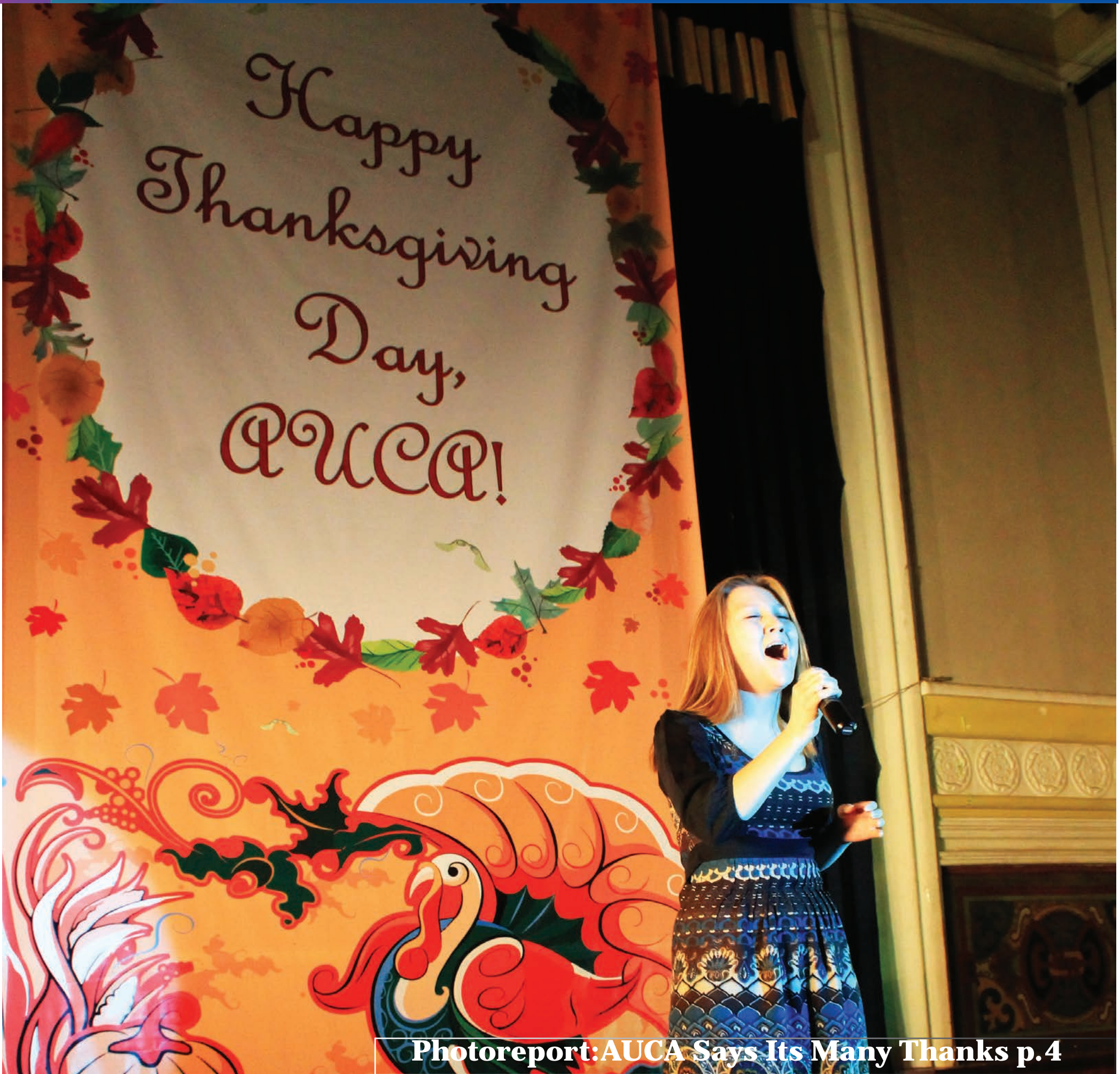
Photoreport: AUCA Says Its Many Thanks p.4