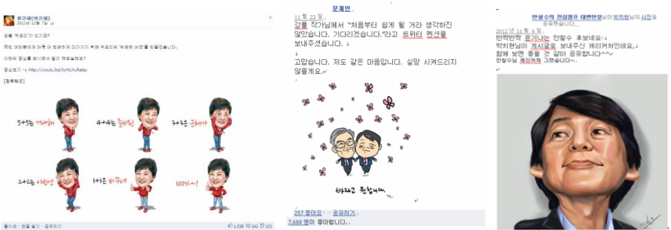
Figure 10. Examples of Visual expression – pictures

from Park Geun Hye from Moon Jae In from Ahn Chul Soo