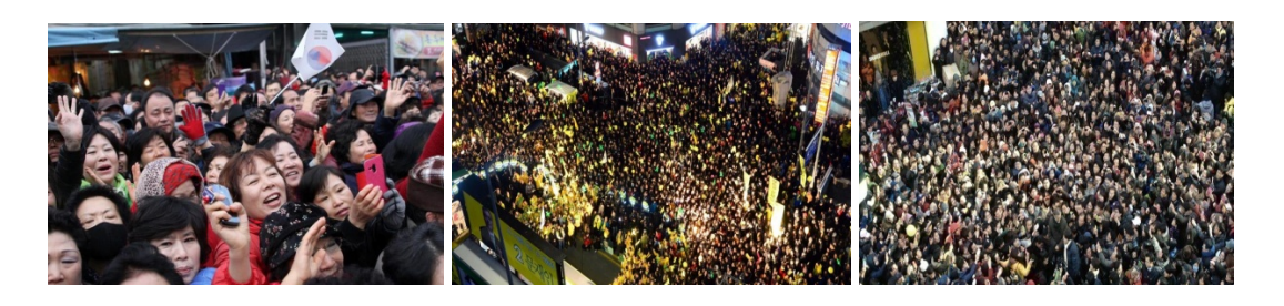
Figure 7. Examples of not appearing the eye contacting

from Park Geun Hye from Moon Jae In from Ahn Chul Soo