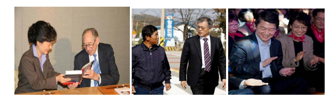
Figure 6. Examples eye contacting

Figure 6 is the examples of eye contacting, one of the non-verbal factor by each candidate