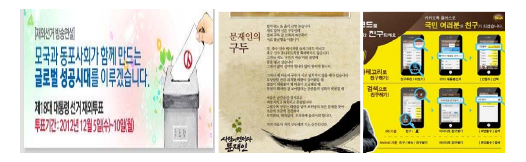
Figure 8. Examples of character appearing without candidate

Figure 8 is the example of non-verbal factor where the character appears without candidates.