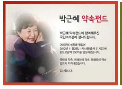
Figure 5. Examples of non-verbal factor

Table 19 shows the frequency of standing position, face expression, and clothes in non-verbal factor of the political advertisements in each candidate's Facebook page.