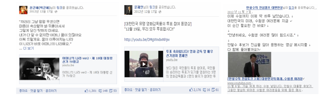
Figure 9. Examples of Visual expression - videos