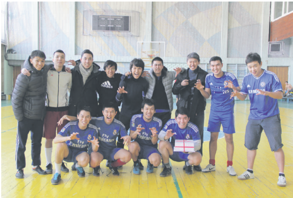
Победители турнира, команда “Илбирс”

22, 23 и 24 февраля прошел отборочный турнир АУЦА по мини-футболу среди студентов и сотрудников университета во Дворце Спорта. Главная цель турнира состояла в том, чтобы отобрать лучших игроков в состав сборной АУЦА для участия в финальной части Универсиады-2014. В турнире приняло участие семь команд, хотя изначально планировалось восемь команд (восьмая команда не явилась на турнир). В результате первого игрового дня в полуфинал вышли четыре команды, которые поборолась между собой за право выйти в финал. В первом полуфинале между собой сыграли команды “Илбирс” и “ICP”, во втором полуфинале боролись команды “USB” и “Staff” (сотрудники АУЦА). В финал вышли команды “Илбирс” и “Staff”, и в нелегкой борьбе победу одержала команда “Илбирс” со счетом 5:2. В матче за третье место выиграла команда “ICP”.