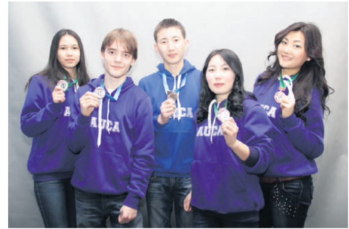
Сборная АУЦА по шахматам

Подводя итог, мы можем сказать, что мы решили