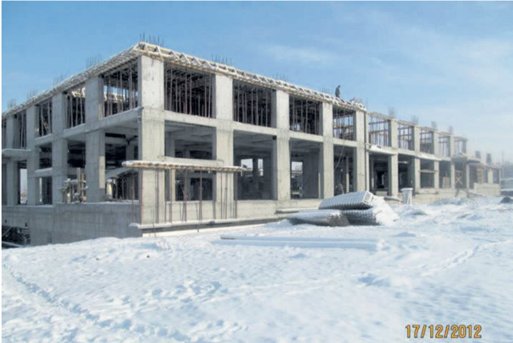
Campus construction in process, December, 2012

Ernest Aitiev, ES-110: We had to move in Fall 2013, did we not?