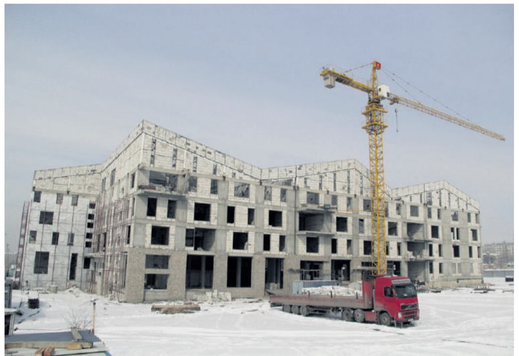
Campus construction process, February, 2014