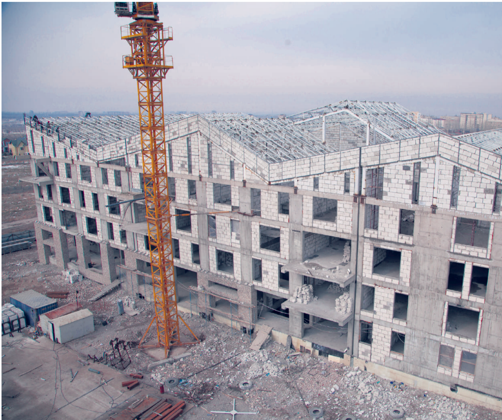
AUCA Campus construction process