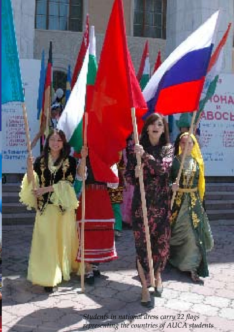
Students in national dress carry 22 flags representing the countries of AUCA students.