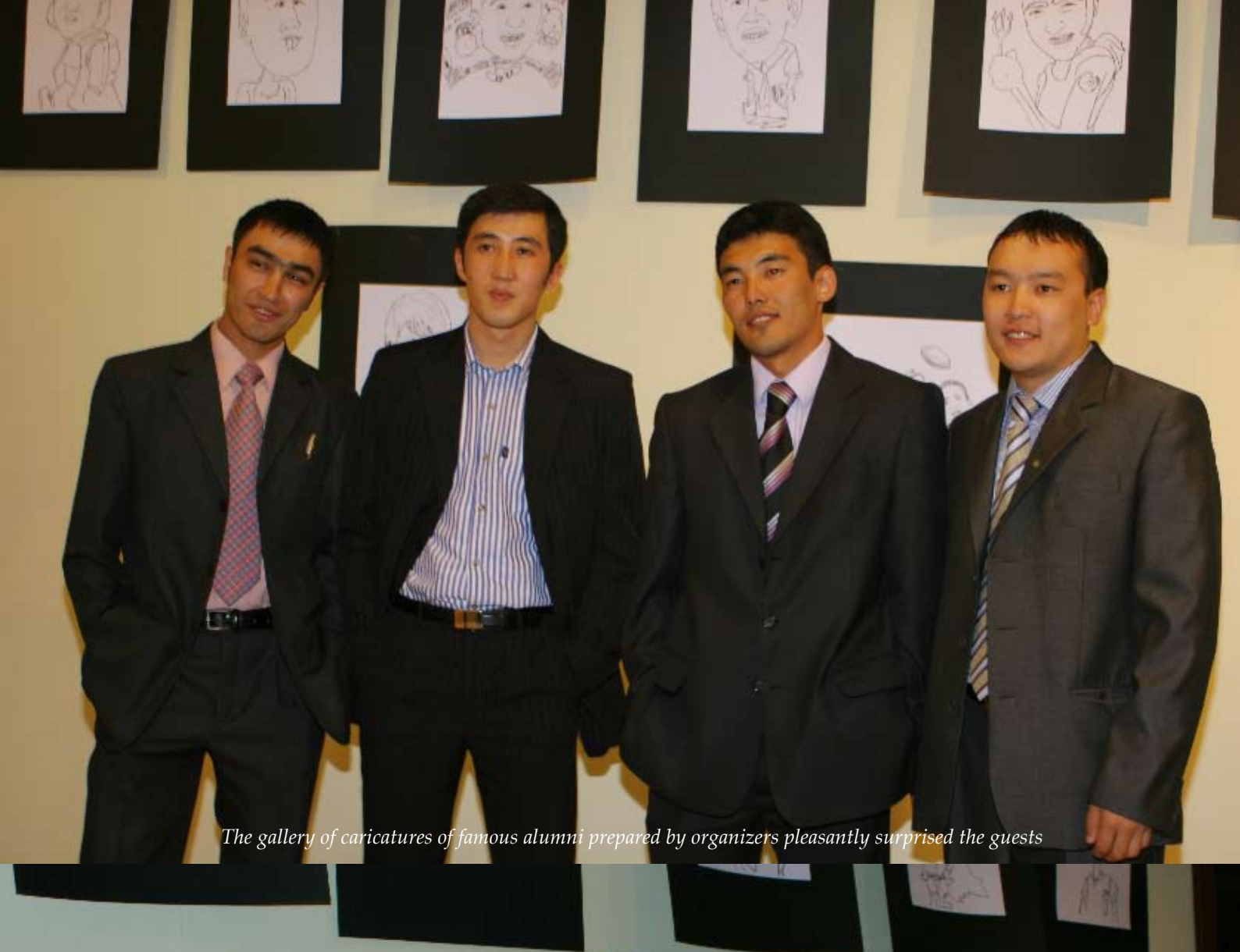
The gallery of caricatures of famous alumni prepared by organizers pleasantly surprised the guests