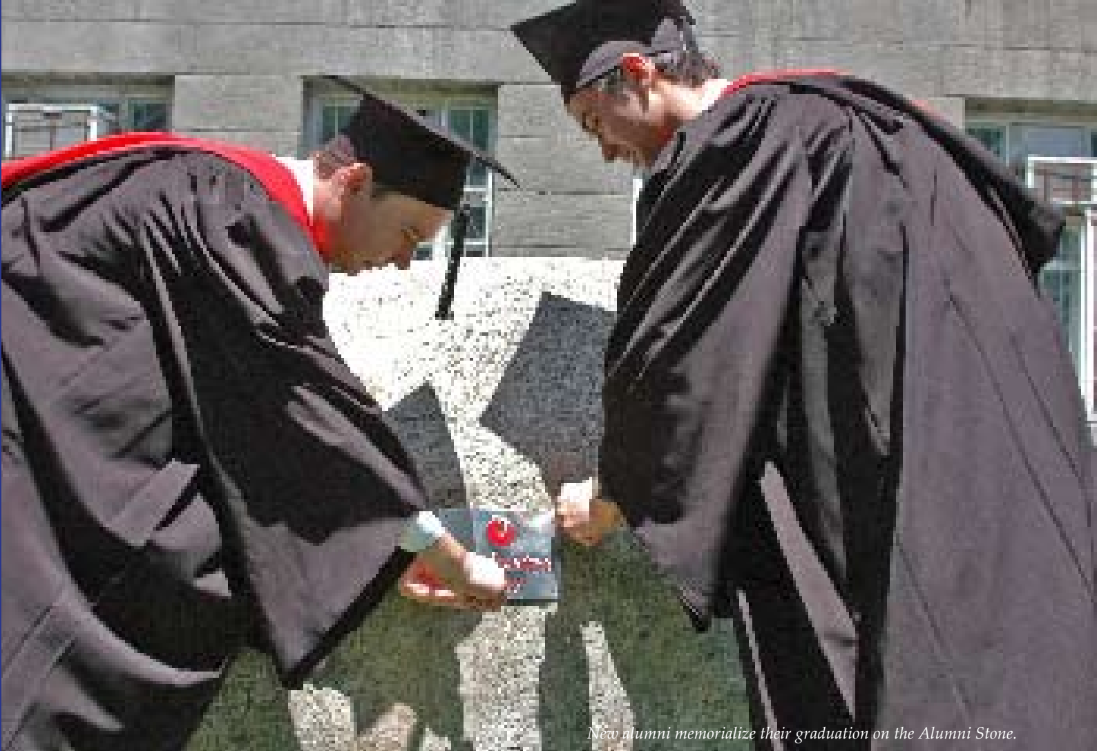
New alumni memorialize their graduation on the Alumni Stone.