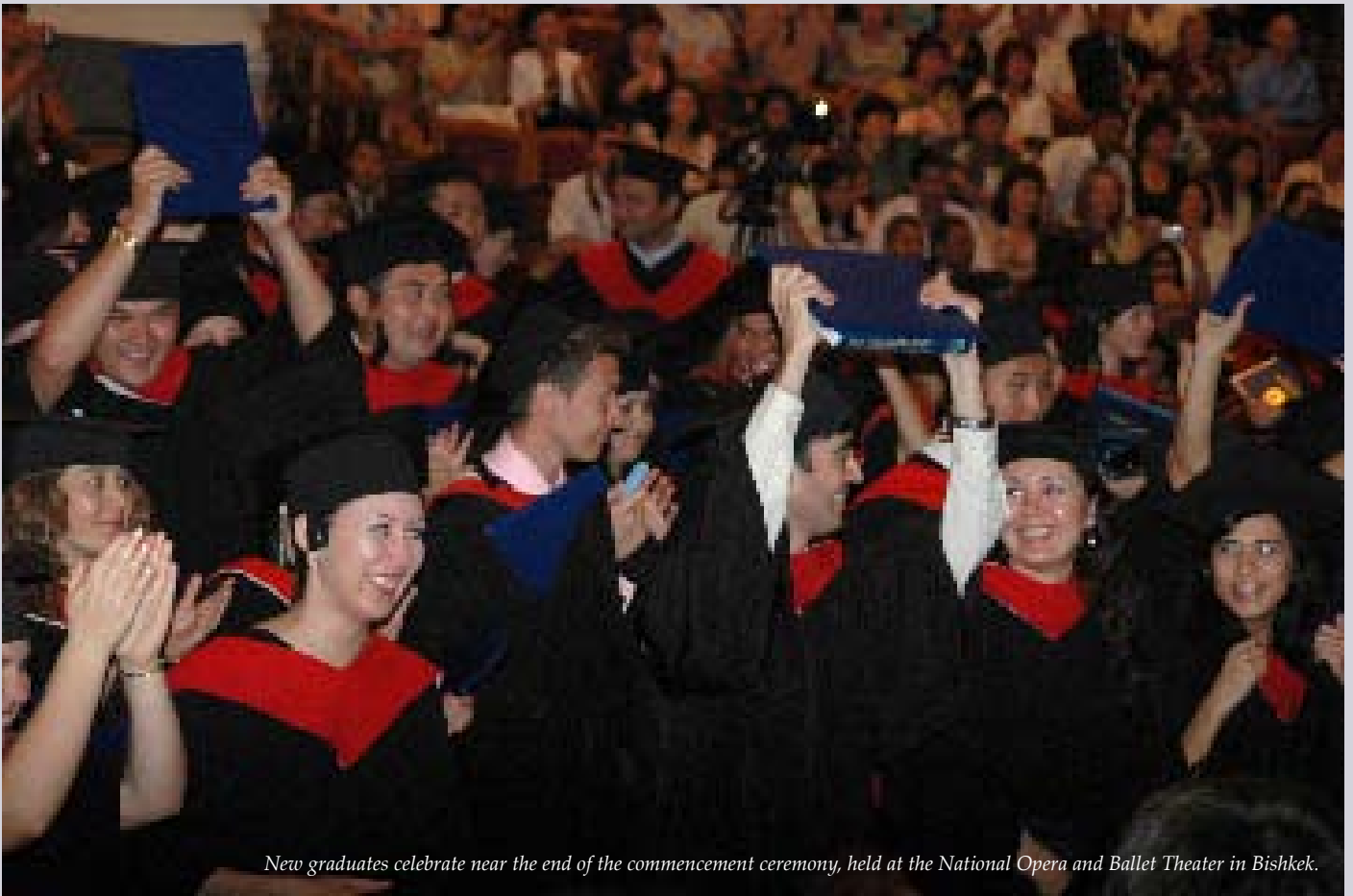
New graduates celebrate near the end of the commencement ceremony, held at the National Opera and Ballet Theater in Bishkek.