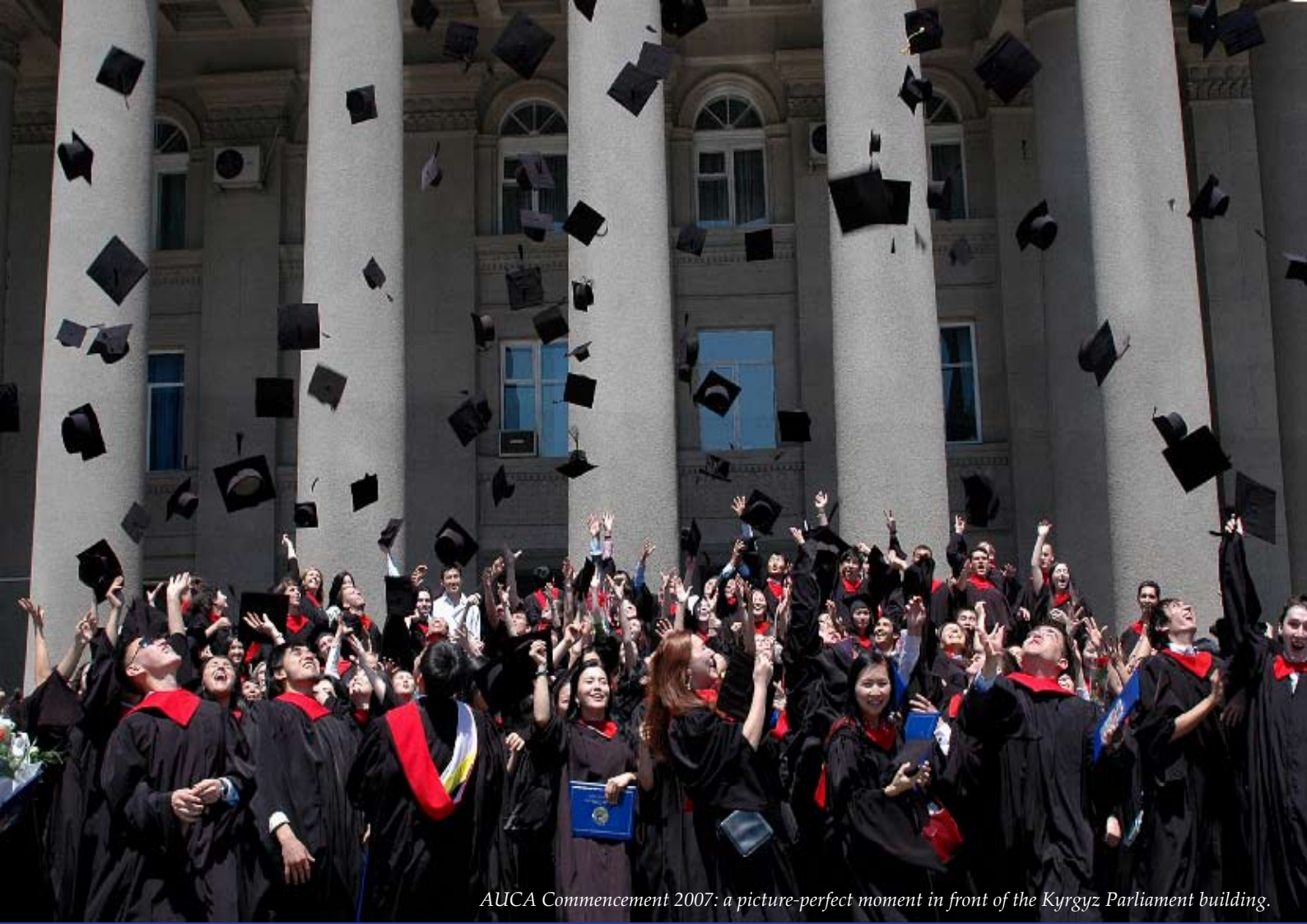
AUCA Commencement 2007: a picture-perfect moment in front of the Kyrgyz Parliament building.