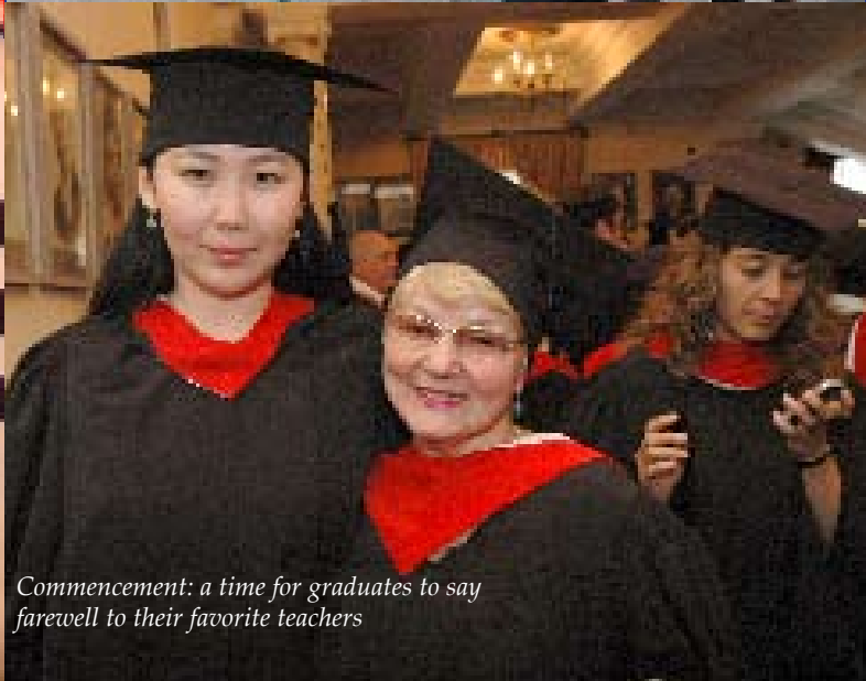
Commencement: a time for graduates to say farewell to their favorite teachers