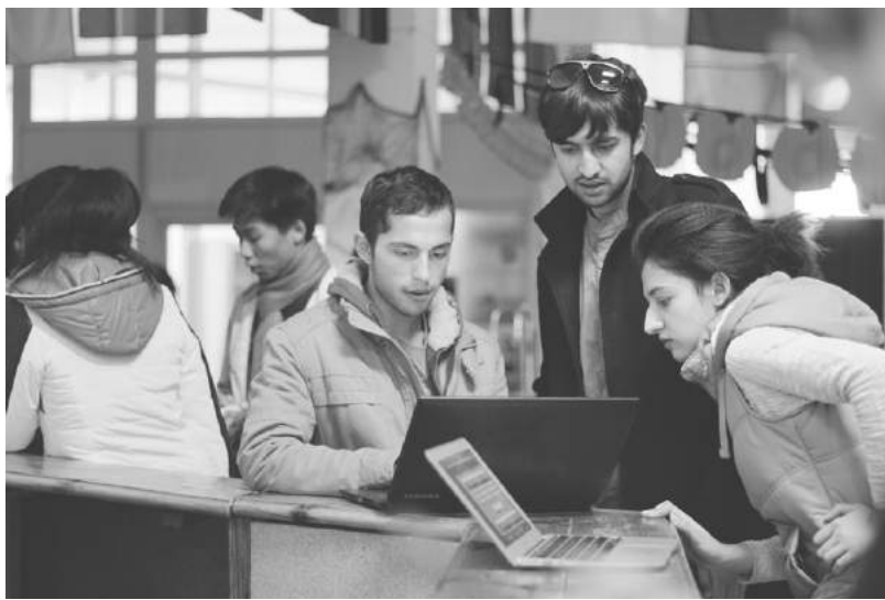
Students trying to register for courses on Saturday at AUCA.

Relating to other registrations there seemed to be no