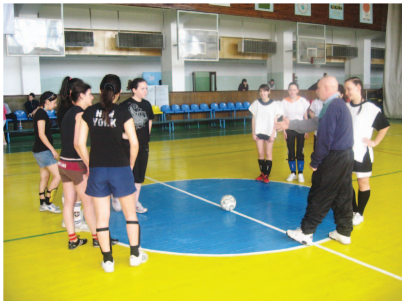
The Bears, the Warriors and the All Stars were fighting on the field. Who were they?

On April 5, Female Soccer Festival was held at the Sport Palace, where three teams fought for first place. The names of their teams were the Bears , mostly comprised of American girls, the Warriors , the journalists' team, and the All Stars , the ICP team. The All Stars became winners, with all the girls dressed in black t-shirts.