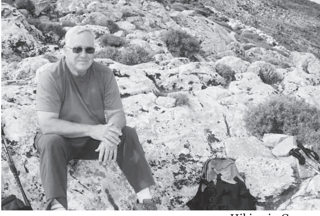
Hiking in Greece

I have been here only for one week, and there is not much things that I