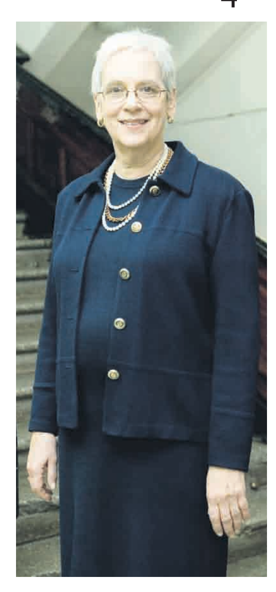
September 1, 2009