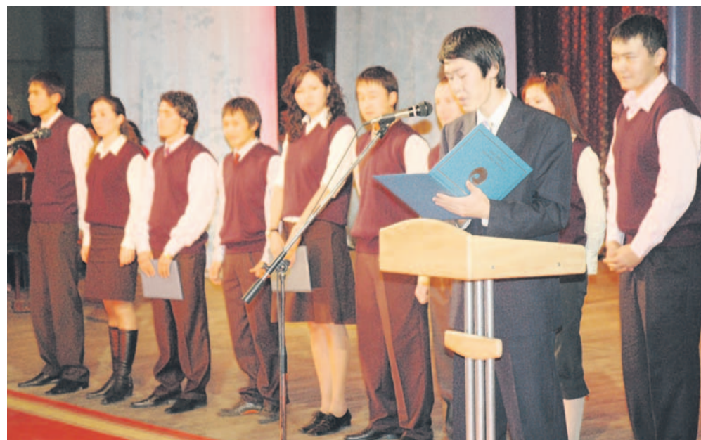
Ceremony of Student Senate rotation, Initiation 2006

Information collected by Nargiza Ryskulova