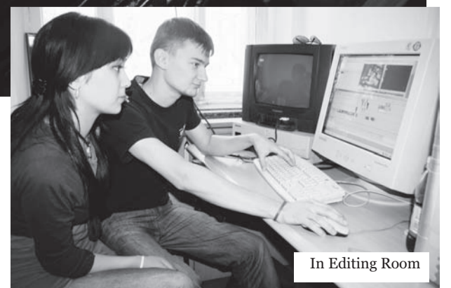
In Editing Room