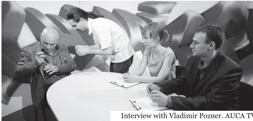
Interview with Vladimir Pozner. AUCA TV

with modern studio production equipment, and not every university can brag about this fact. Having above mentioned equipment is an essential factor for TV, but anyway the most important work lies on AUCA. TV crew.