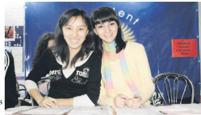
Student Senate Elections 2008