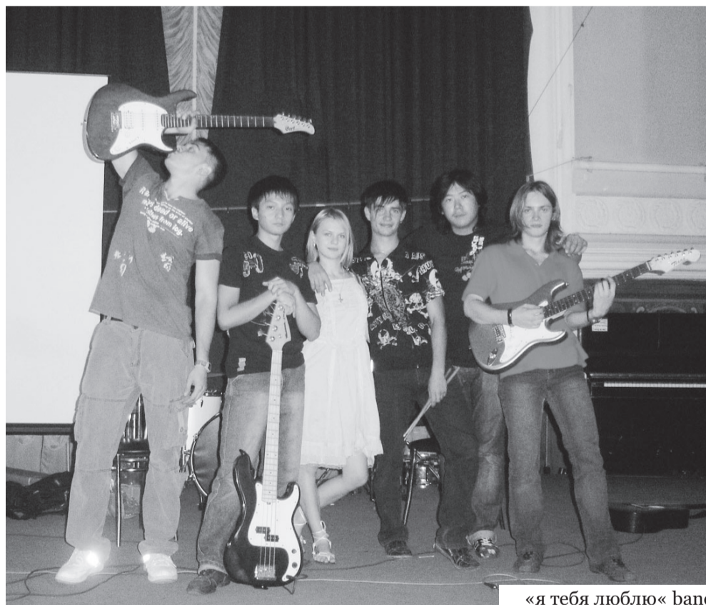
«я тебя люблю» band