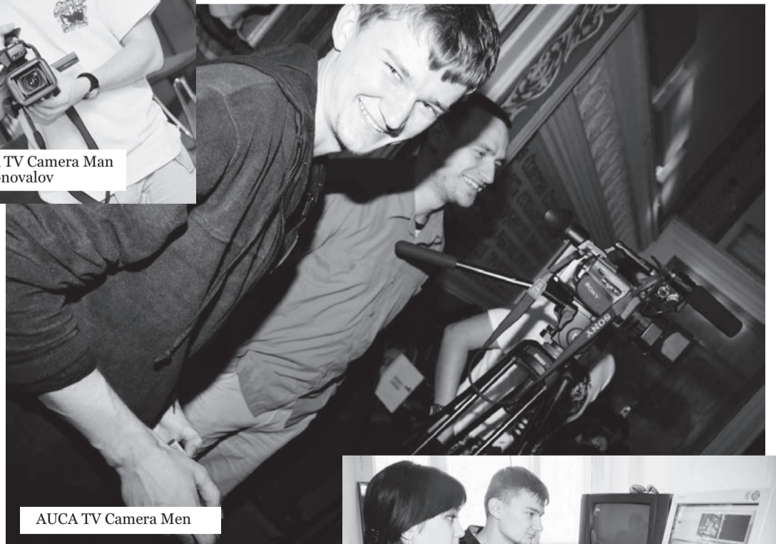
AUCA TV Camera Men