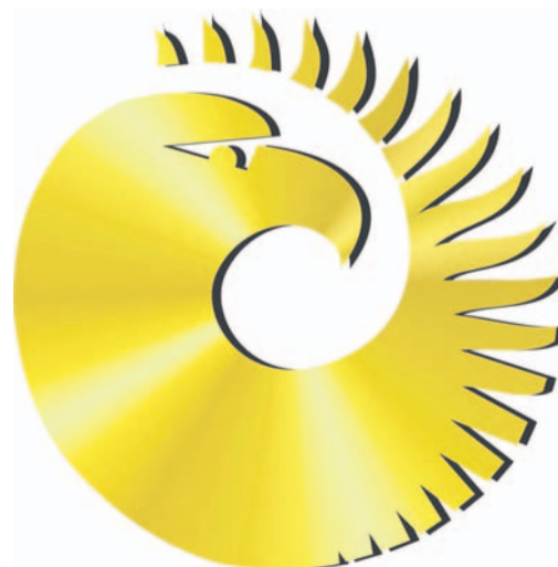
All about Student SENATE p. 4