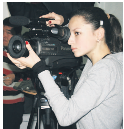
Let it Be - AUCA.TV p. 6